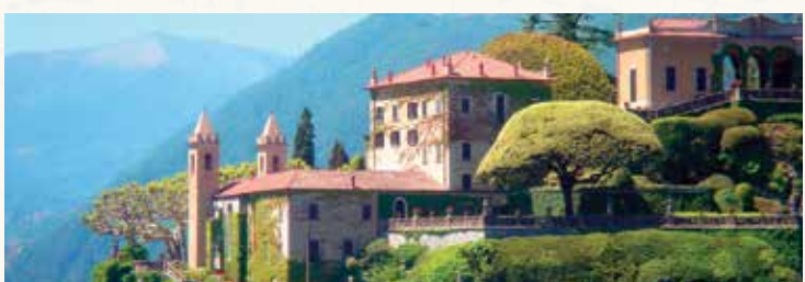
Legendary Villa del Balbianello on the shores of Lake Como.