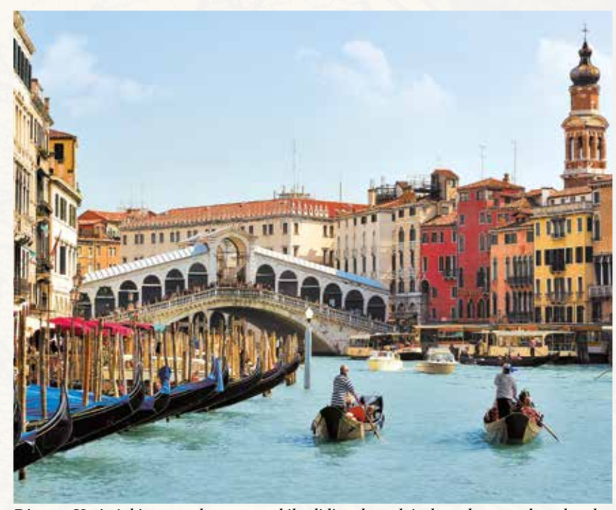
Discover Venice's history and romance while gliding through its legendary canals and under the iconic Rialto Bridge.

mmerse yourself in the true essence of town and country life in northern Italy in spectacular Venice and the fabled Lake District. In picturesque Cernobbio, spend four nights in a lake-view room in the charming HOTEL REGINA OLGA. Enjoy a private boat cruise on Lake Como, a setting that has inspired poets, composers, artists and philosophers for centuries. Explore the treasures of Bellagio, Villa del Balbianello and Stresa; cruise across Lake Maggiore to the Borromean Islands; and walk through storied Verona, a UNESCO World Heritage site, to see the balcony where Juliet yearned for her Romeo. In the floating city of Venice, spend three nights in a four-star hotel near Piazza San Marco. Enjoy a private boat cruise along the famous palace-lined Grand Canal and experience the city's cobblestone alleys and meandering waterways. Enriching lectures and the exclusive Town & Country Life Forum® with local residents provide personal perspectives of the region. This comprehensive small group program is the best way to experience northern Italian town and country life. Milan Pre-Program.