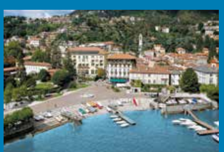
Hotel Regina Olga and Lake Como